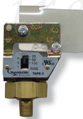
TDPS-3 Adjustment Range 20-120 PSI