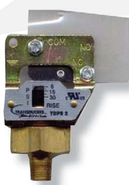
TDPS-2 Adjustment Range 6-30 PSI